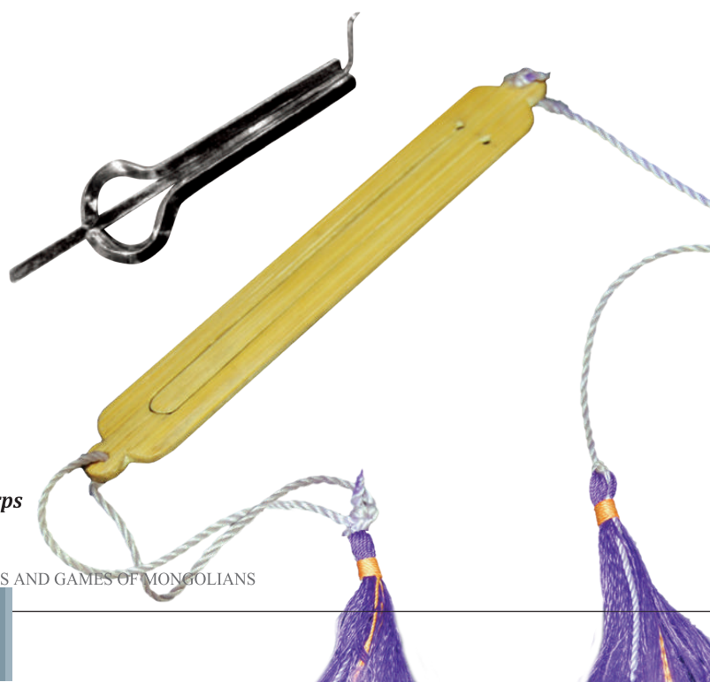
Metal and bamboo Jew's harps